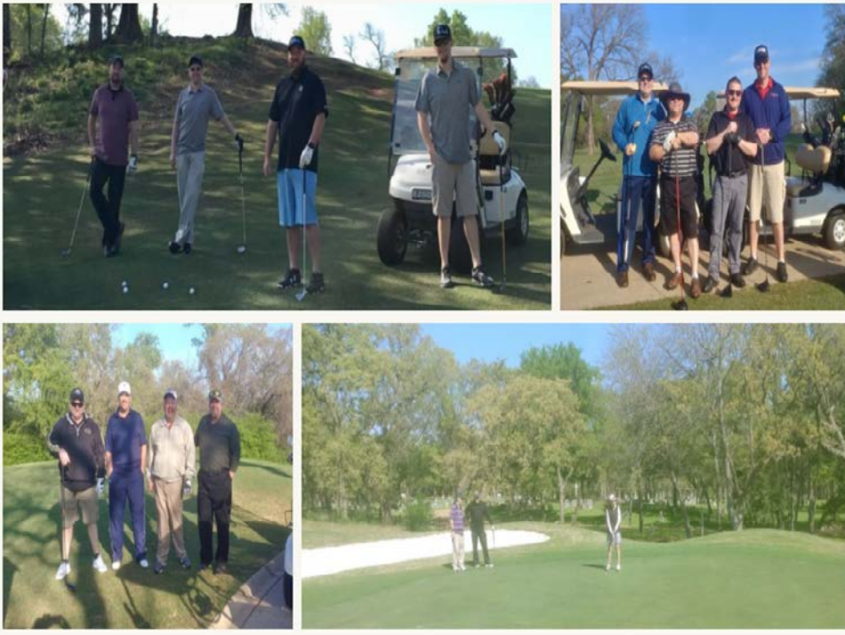
A few shots from the green at the 2018 NCTTRAC Golf Tournament

We are tremendously grateful to everyone who sponsored, participated in and contributed to the 3 rd NCTTRAC Scramble Golf Tournament on Friday, March 30 th . What started out as a chilly morning ended with beautiful weather, making it a perfect day to be out on the green!